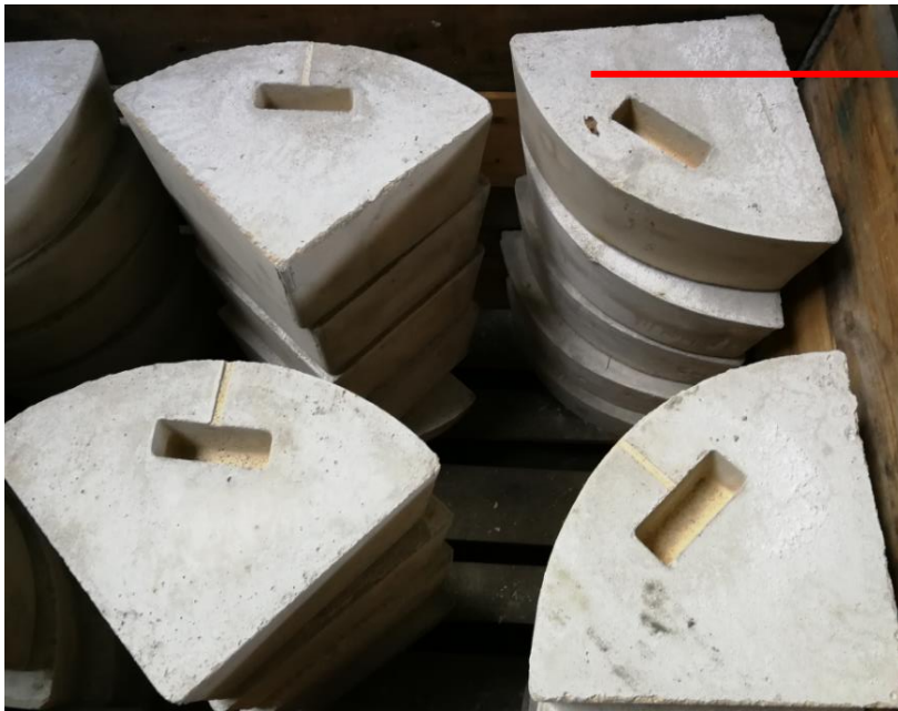
View from top